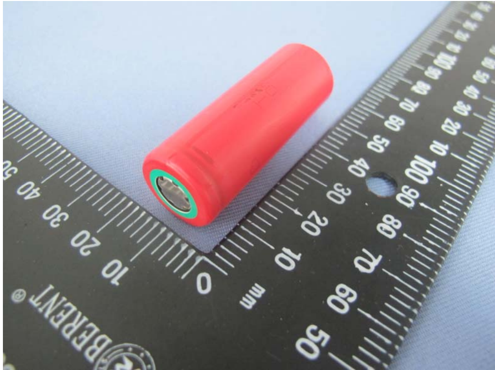
Figure 3 Top view of cell